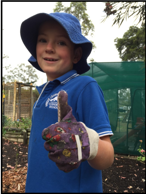
We love our Kitchen Garden Program!