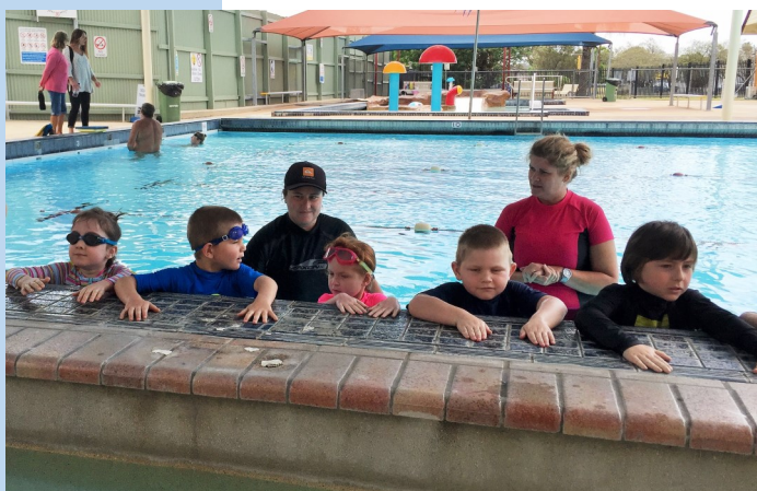
Enjoying swimming lessons!

Road Safety Workshops: Next Thursday morning (November 5th) our students will join Paxton PS students in participating in road safety workshops, at Paxton PS. Part of this will be learning how to be a safe bike rider when on the road and / or around traffic and students will need to bring their bike helmet to school for the workshops. As the students will be attending in two groups, both Primary and Juniors, transport to and from the workshops will be via teacher's private vehicles. Parents are more than welcome to attend these workshops and transport their own children and times of the workshops are on the permission form. Please return the permission form and accompanying medical information form as soon as possible.