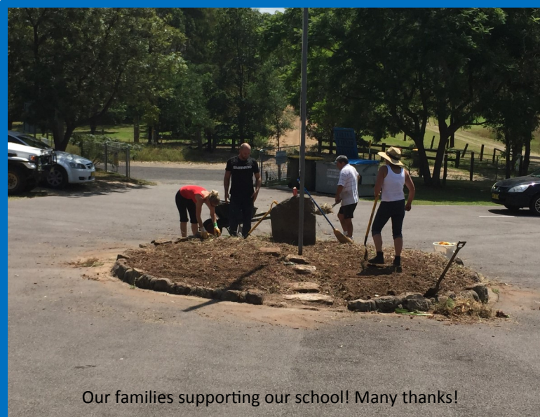
Our families supporting our school! Many thanks!