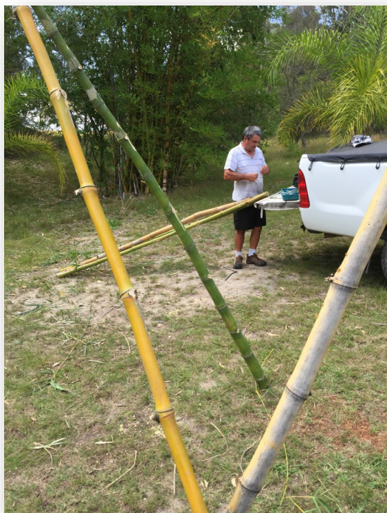
Making tepees for our Harvest Festival.

All funds raised help our students in their learning programs.