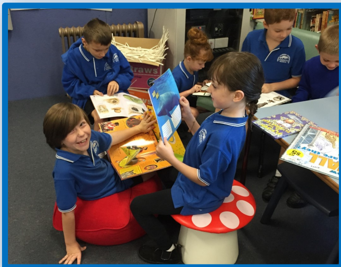
Our children do love reading time!

- a proud member of the Cessnock Community of Great Public Schools