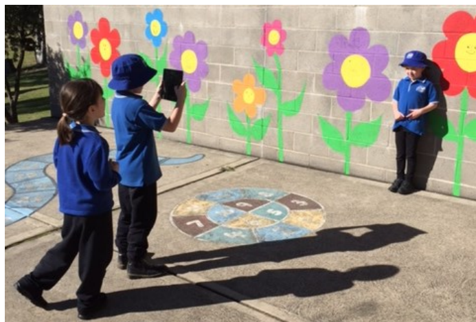
Working on their measurement story.....