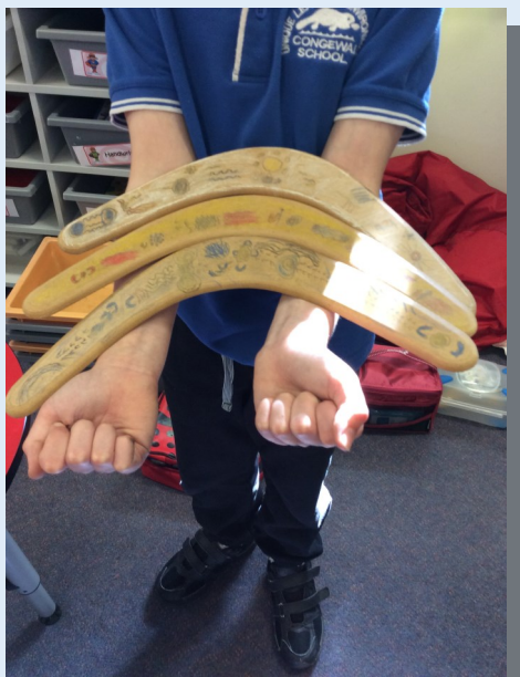
Making boomerangs for our NAIDOC activities.....