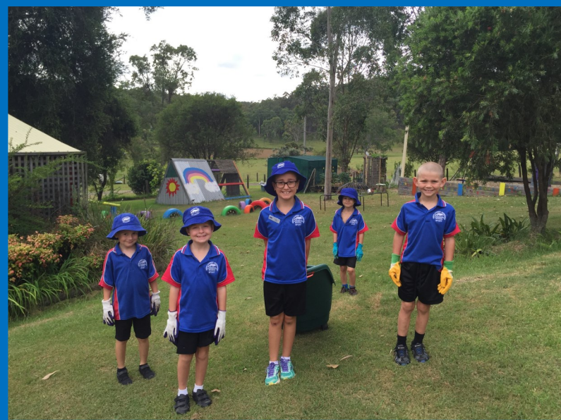
- keeping our school looking great!