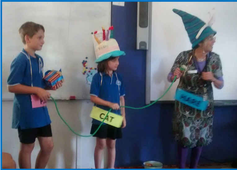
Learning how much fun books can be.....

- a proud member of the Cessnock Community of Great Public Schools